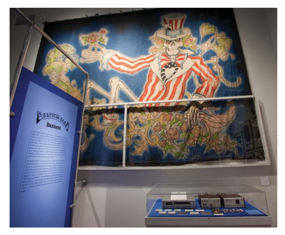
Figure 2. Grateful Dead Ticketing Hotline case and headphones. Photograph by Laura Mozes, 2012.