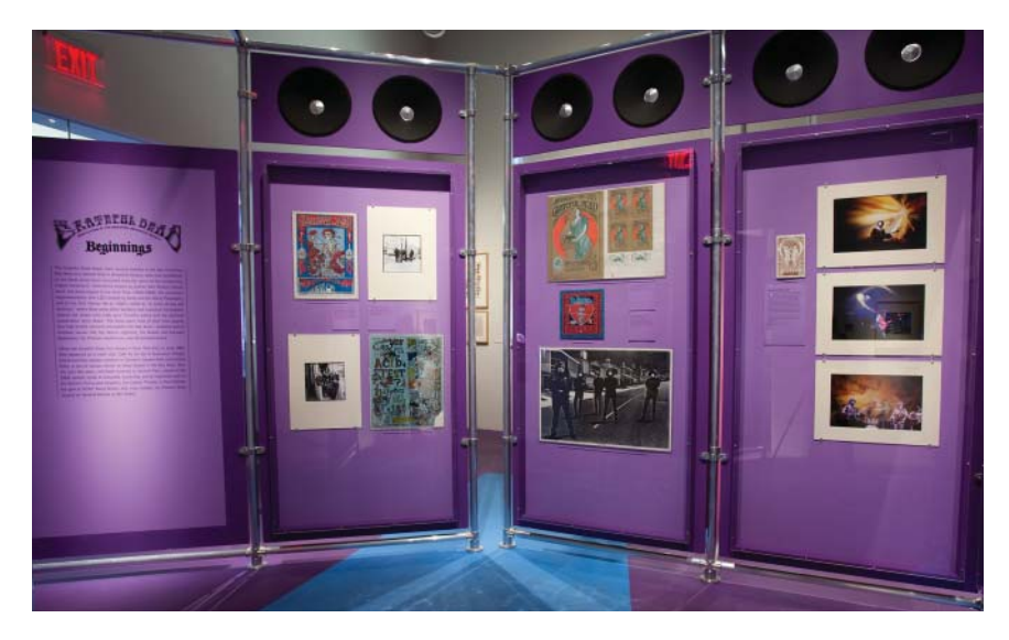
Figure 1. "Beginnings," the first section of the Gallery.